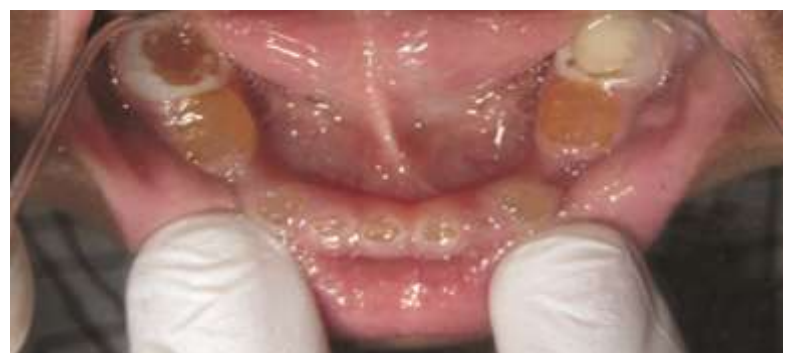
Fig. 2 showing pre-treatment intraoral occlusal view of mandibular arch