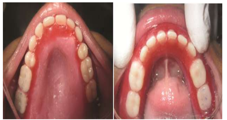
Fig. 7 showing intr-oral occlusal view of arrangement of teeth in maxillary and mandibular arch