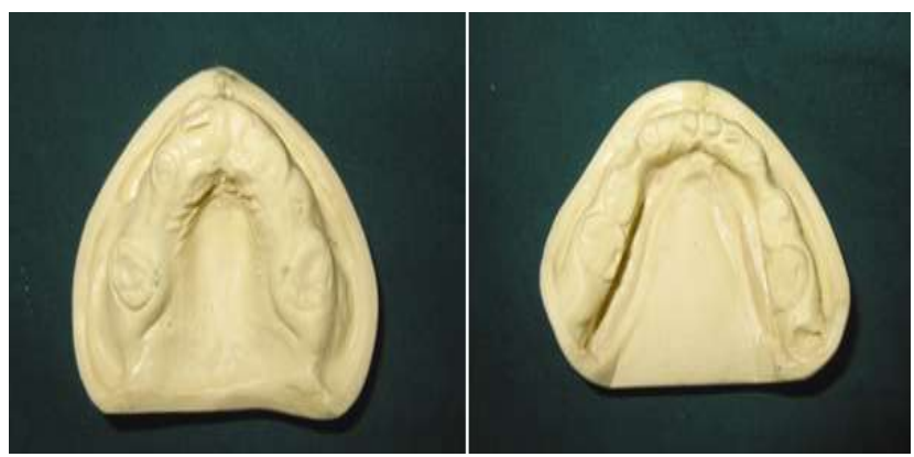
Fig. 6 showing master cast