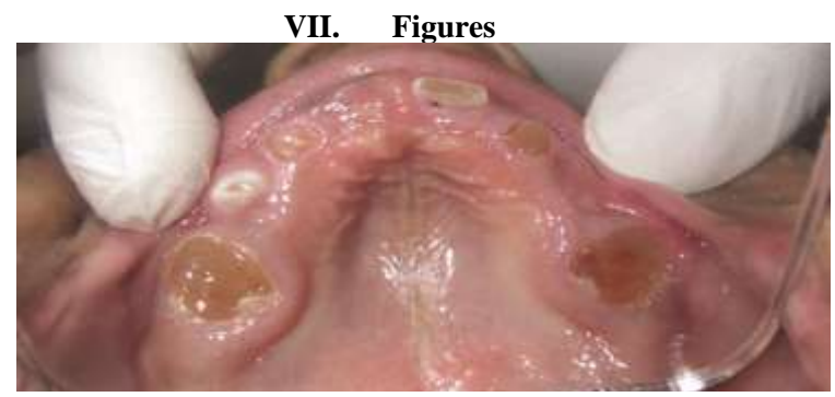
Fig. 1 showing pre-treatment intraoral occlusal view of maxillary arch

Complete overlay denture has numerous advantages for the paediatric patient. Apart from improved mastication and aesthetics of the patient, speech also may be improved. The alveolar bone is still being maintained by the retention of teeth compared to its loss when teeth are extracted. With the retained roots of the teeth and their periodontal ligament, there is improved proprioception as compared to a complete denture that is fabricated over an edentulous ridge.(10) Compared to an overdenture, an overlay denture is cost effective, requires less chairside time, and does not require any specialized tooth preparation. When fabricated properly, an overlay denture has good support with excellent retention and stability. Possibly, the most important advantage of an overlay denture is the positive psychological support for the child.