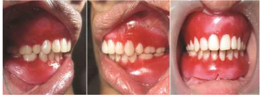
Fig. 8 showing intraoral views and inter-occlusal relationship between two arches.