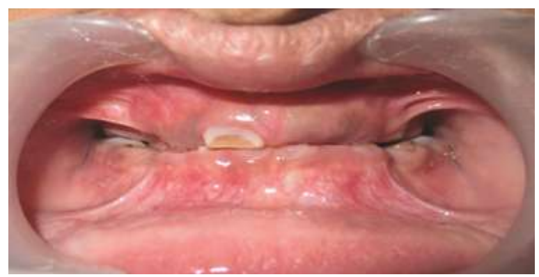
Fig. 3 showing intraoral anterior view of a patient presenting severely worn maxillary and mandibular dentition and loss of VDO.